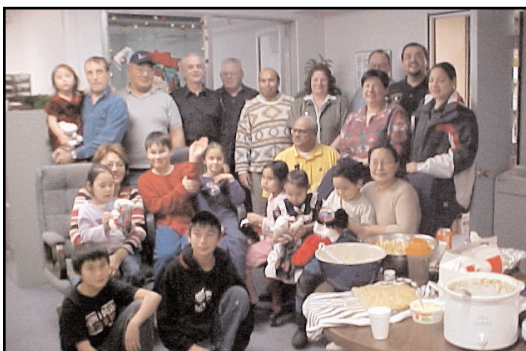
Inuvik regional staff gathered for some well-